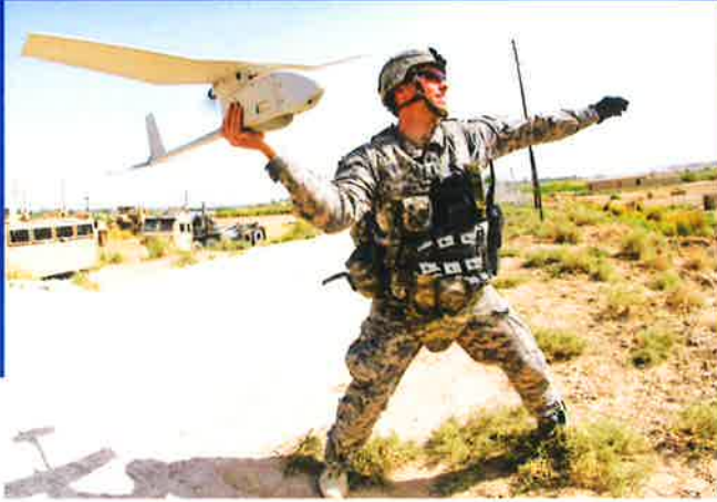
AeroVironment's RQ-11 Raven