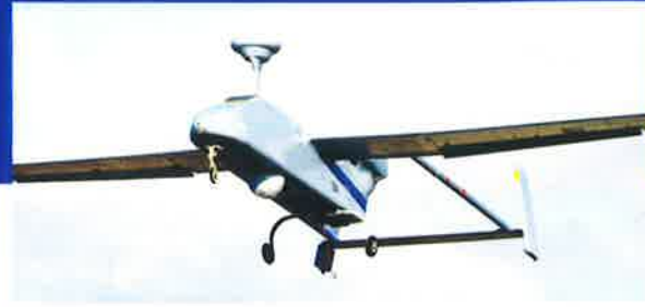
Searcher Mk II